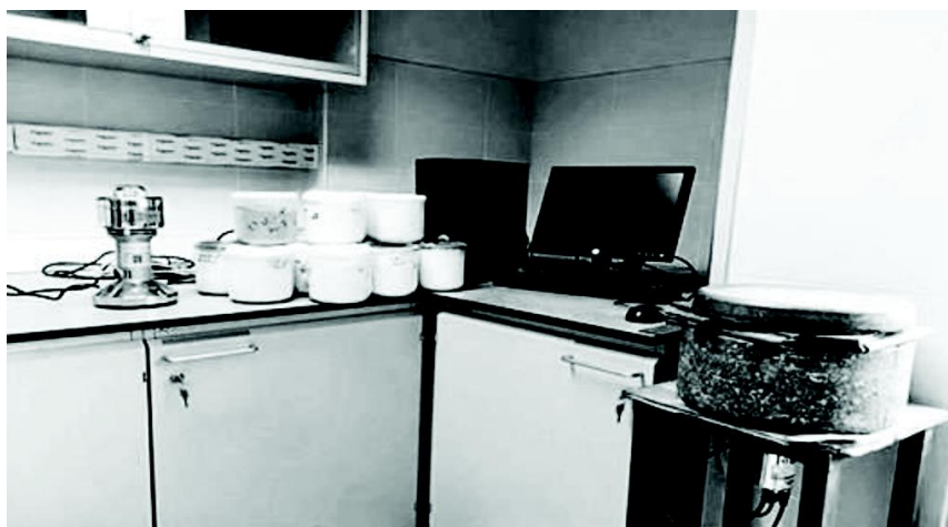
Fig.2. The gamma measuring system of the rice samples.

All mentioned devices were prepared by Canberra industries INC. and arranged as a system as shown in Fig.2.